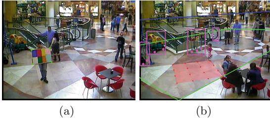
Fig. 1. (a) Detected chessboard points for camera calibration; (b) Horizontal vanishing line (blue), ground plane’s projection area (green), ground points (red) to calculate scale factors and reprojection errors, and objects of interest (purple) (Color figure online).

We trained a multi-class classifier to identify the different G.B.s. Each sample is a sequential number of frames with I.P.s and G.B.s labels, individual trajectories and gaze orientations. Each sequence is treated as a bag. On each bag a temporal sampling, \tau , is assumed to acquire feature information from key-point trajectory sampling and form a descriptor. The final descriptor vector for each behaviour is a histogram obtained by nearest cluster counting, which is used as input for the SVM classifier.