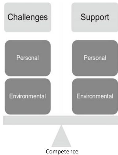
Fig. 2.1 Autism competency enhancement model

Challenges. Personal challenges include biological predispositions that increase risks to developing competence. In ASD, neurobiological differences in brain development and function are examples (Volkmar 2005). Such differences lead to impaired ways of processing information from the environment as well as