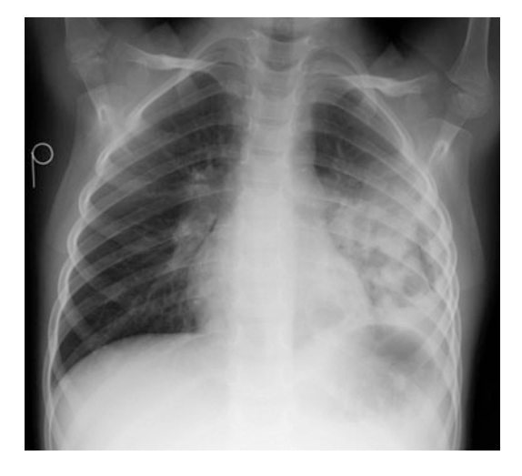
Fig. 1 Plain chest radiograph. Extensive consolidation with multiple irregular lucency areas in the middle and lower field of the left lung