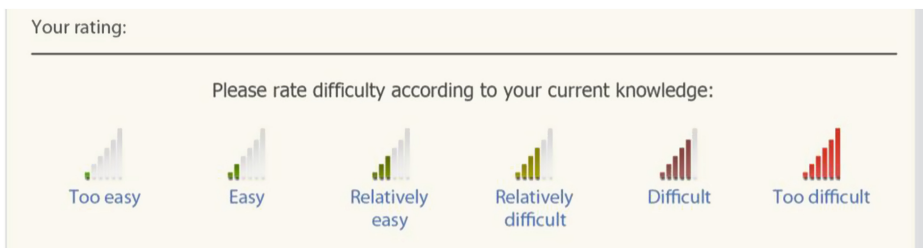
Fig. 1. Student rating estimation interface shown after interaction with exercise-type or question-type learning object.

The ALEF is currently being used for its fifth year, having served over 1200 students in courses on Functional Programming, Logic Programming, Procedural Programming and Principles of Software Engineering. We started collecting the difficulty ratings halfway through. Perhaps the most relevant ratings are for exercises in programming courses. We observed 3,540 user expressed difficulty ratings for these learning objects, the distribution is shown in Fig. 2. Let the student determined difficulty ratings for a learning object be denoted as x_u and expert estimated difficulty as x_e . We found that students see the difficulty similarly to the domain expert with \bar{x}_u = 0.56 , \bar{x}_e = 0.54 ; \tilde{x}_u = 0.55 , \hat{x}_e = 0.5 ; and corr(x_u, x_e) = 0.62 .