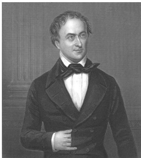
Fig. 2.20 Portrait of Heinrich Rose (1795–1864)