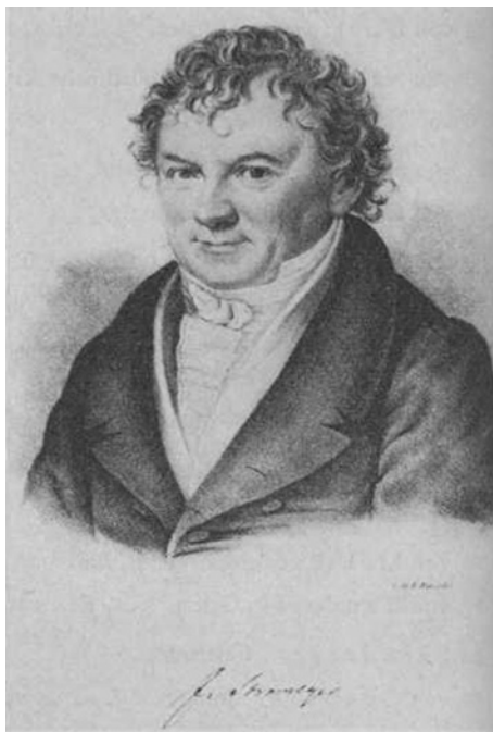
Fig. 2.18 Portrait of Joseph Fraunhofer (1787–1826)