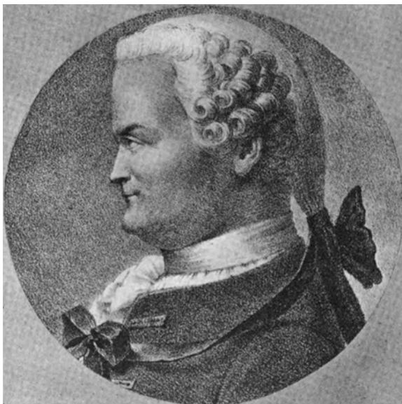
Fig. 2.9 Portrait of Johann Heinrich Lambert (ca. 1728–1777)

Lambert's book, Photometria [95], that deals with optical measurements was published in 1760. In it, he stated: