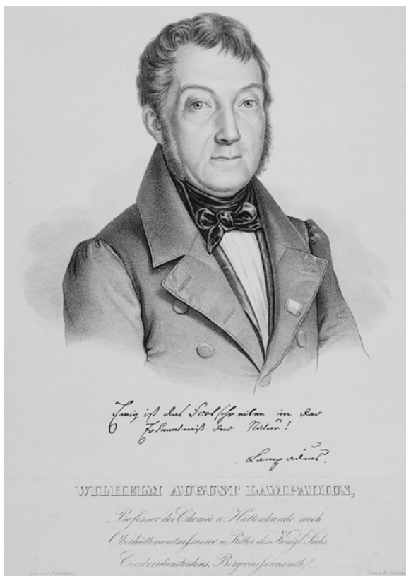
Fig. 2.15 Portrait of Wilhelm August Lampadius (1772–1842)

with G.C. Lichtenberg and J.F. Gmelin, serving as experimental assistant in their courses. Lichtenberg introduced him to his future employer, Count J. von Sternberg.