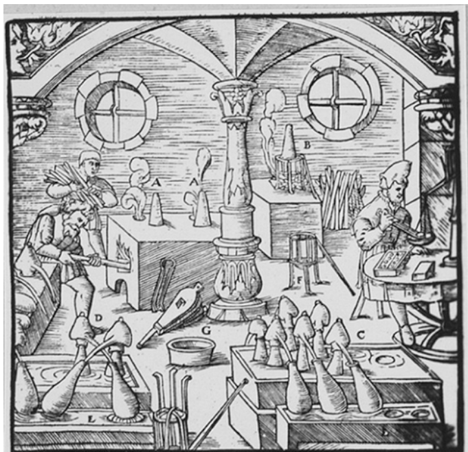
Fig. 2.2 Agricola's illustration of the acid parting of gold and silver [16]. A—Ampullae arranged in the vessels. B—An ampulla standing upright between iron rods. C—Ampullae placed in the sand which is contained in a box, the sprouts of which reach from the opercula into ampullae placed under them. D—Ampullae likewise placed in sand which is contained in a box, of which the sprout from the opercula extends crosswise into ampullae placed under them. E—Other ampullae receiving the distilled aqua and likewise arranged in sand contained in the lower boxes. F—Iron tripod, in which the ampulla is usually placed when there are not many particles of gold to be parted from the silver. G—Vessel

and Latin authors referring to mining. He resigned in 1530 and spent the next 2–3 years in study and travel. About 1533, he became town physician of Chemnitz in Saxony, where he remained until his death in 1555.