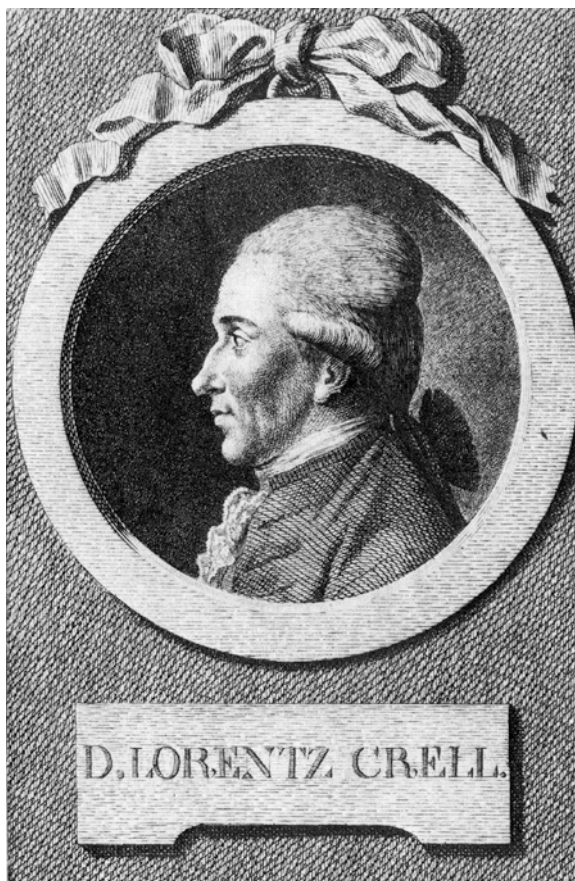
Fig. 2.12 Portrait of Lorenz Florenz Friedrich von Crell (1745–1816)

Soon after his return to Germany, he was appointed to the new chair of chemistry in the Collegium Carolinum (now Technische Universität) Brunswick in 1771 [24IX]. He was Professor of Philosophy and Medicine at the Universität Helmstedt from 1773 until its closure in 1810 by the Napoleonic regime, when he transferred to Göttingen [24X]. He is primarily remembered for his literary activity although he carried a number of original researches on inorganic materials and on natural products [121].