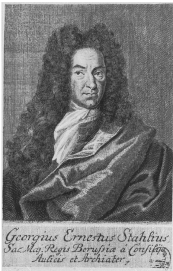
Fig. 2.7 Portrait of Georg Ernst Stahl (1660–1734)

Andreas Sigismund MARGGRAF (born 3 March 1709, Berlin; died 7 August 1782, Berlin) was one of the most famous and experimentally adept chemists of the phlogiston period; his interest in chemistry for its own sake, his refinement of analytical tools and his use of the balance anticipated some facets of the chemical revolution and the demise of the phlogiston theory [24c, 79–81], (see Fig. 2.8 for his portrait).