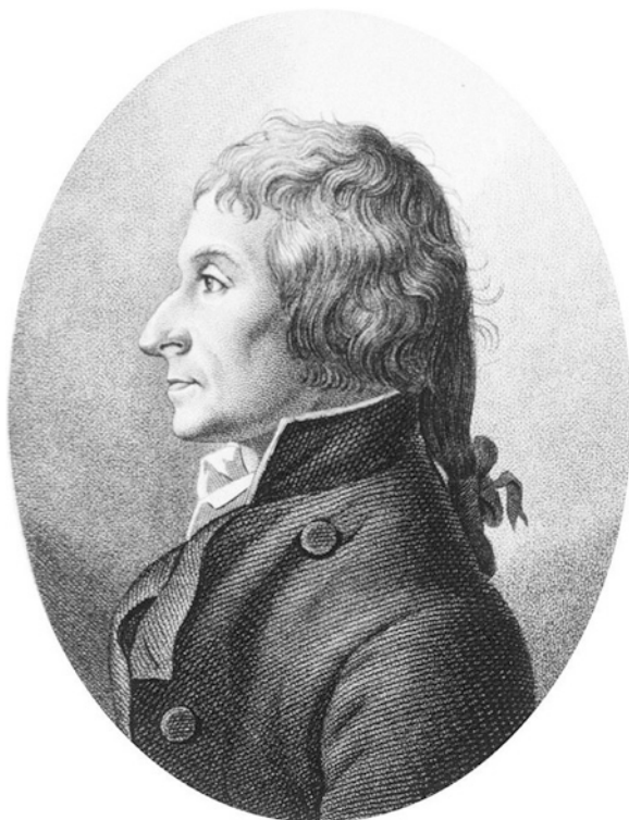
Fig. 2.14 Portrait of Jeremias Benjamin Richter (1762–1807)