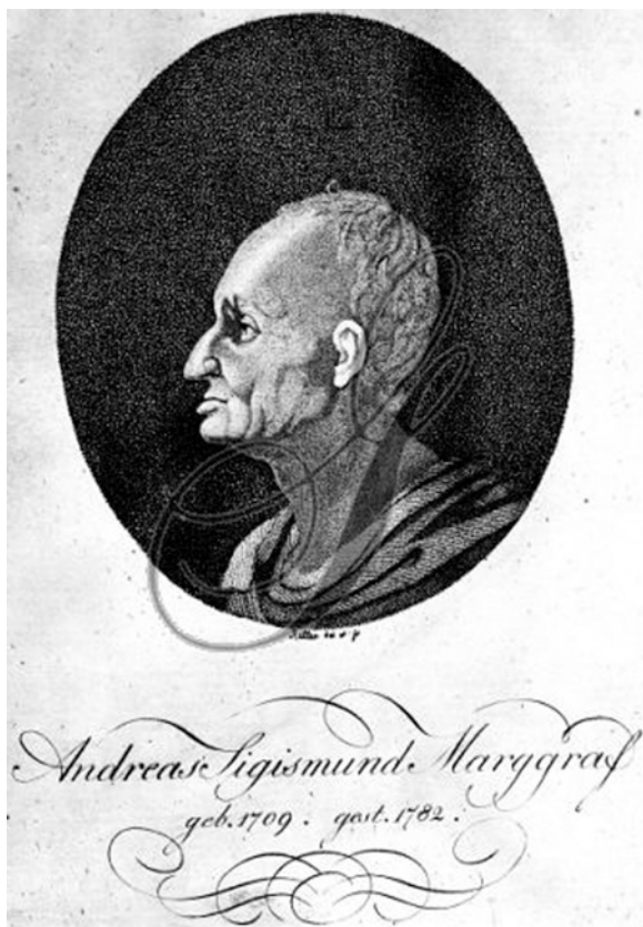
Fig. 2.8 Portrait of Andreas Sigismund Marggraf (1709–1782)

new chemical laboratory and from 1760 Director of its Class of Experimental Philosophy. Many of his papers were published in the journals of the Berlin Academy and are available as collected works in German [82] and in French [83].