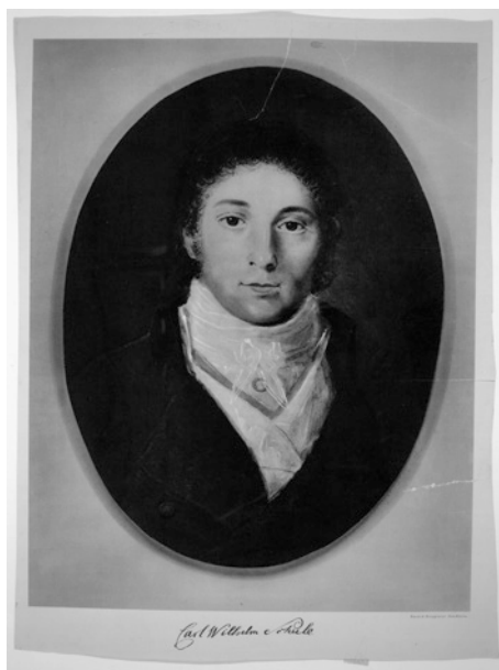
Fig. 2.10 Portrait of Carl Wilhelm Scheele (1742–1786)