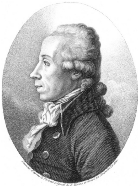
Fig. 2.11 Portrait of Martin Heinrich Klapproth (1743–1817)

Klapproth discovered or co-discovered zirconium, uranium, titanium, strontium, chromium and cerium and confirmed the prior discoveries of tellurium and beryllium. After confirming several of Lavoisier's experiments, he abandoned the phlogiston theory and was the first important German chemist to openly accept the