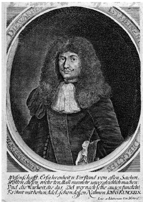
Fig. 2.5 Portrait of Johann Kunckel (1638–1703), from Ars vitaria [49]

Johann KUNCKEL (born ca. 1630 Hütten, Schleswig; died 20 March 1703, Stockholm), was awarded Swedish nobility in 1693 under the name Johann von Löwenstern-Kunckel [24a, 50, 51] (see Fig. 2.5 for portrait). He was the son of an alchemist and had no university education and learned chemistry from his father and practical chemistry from pharmacists and glassworkers. He eventually became pharmacist to the Duke of Saxe-Lauenburg, later to the Elector of Saxony; he lost this post and then taught at the Universität Wittenberg [24I]. In 1679, he went to the court of Friedrich Wilhelm, Elector of Brandenburg. On the elector's death in 1688, he entered the service of King Charles XI of Sweden as Minister of Mines and was ennobled in 1693 as Baron von Löwenstern.