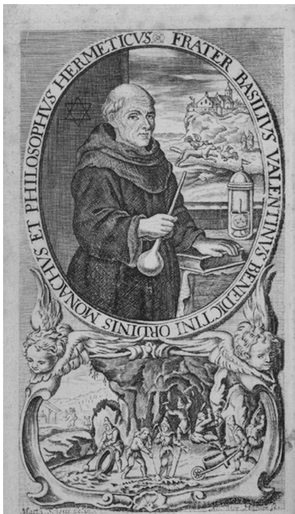
Fig. 2.3 Portrait of Basil Valentine

Andreas LIBAVIUS his given name was Andreas Libau but he is more well known under the Latinized Libavius (born ca. 1560 Halle/Saale; died 25 July 1616, Coburg) studied first at the Universität Wittenberg [24I] and then at Jena [24II] where he was graduated in medicine [35–37]. He occupied several teaching posts and was town physician in Rothenburg ob der Tauber, 1591–1607, before becoming director of the Gymnasium (academic high school) at Coburg in 1607, where he died in 1616. He was an enthusiastic chemical practitioner and author of numerous works on chymistry, religious matters and on education. He was not blind follower of Paracelsus and carried on controversies with both Paracelsists and Galenists. Libavius was an exponent of the iatrochemical trend in medicine; as a result, the application of chemicals was stressed in his writings. He was among the first to describe chemicals and their reactions in clear plain language. His most famous work, Alchemia (1597), is clear