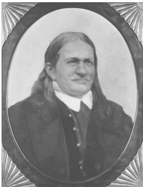
Fig. 2.19 Portrait of Friedlieb Ferdinand Runge (1794–1867)

Friedlieb Ferdinand RUNGE (born 8 February 1794, Billwärder (now part of Hamburg); died 25 March 1867, Oranienburg) at the age of fifteen was apprenticed to an apothecary in Lübeck (see Fig. 2.19 for his portrait). He then studied medicine in Berlin, Göttingen and graduated for the Universität Jena in 1819 [154, 155]. His dissertation dealt with the physiological effects of belladonna. Runge was asked to demonstrate the dilation experiment on his cat for Goethe who was so impressed he gave him some rare coffee beans and suggested him to try to determine what compound in the beans gave them their physiological effect [156]. Runge accepted the challenge and within months isolated caffeine from them. Runge then returned to Berlin and received a doctorate in chemistry in 1822.