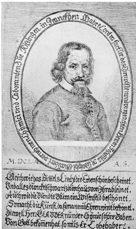
Fig. 2.4 Portrait of Johann Rudolf Glauber (1604–1670) by Anthonius Santvoort (1654 AS). The inscription round the portrait reads (translated), “True portrait of the honoured and highly esteemed Johannis Rudolphi Glauberi Noble chemist and experimenter at Kitzingen in Franconia”

work is Furni novi philosophici . (New Philosophical Furnaces) [47, 48], a book, written with clarity, which established his reputation, as a master of laboratory skills. In the Preface to the English translation of collected works [49], Packe said the Latin works were then very scarce and expensive in London. He purchased the copperplates in Amsterdam with the legends in German. Packe knew no German so he translated the Latin works. His list of subscribers included Robert Boyle and William Penn.