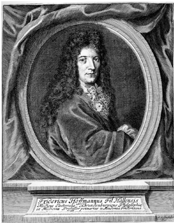
Fig. 2.6 Portrait of Friedrich Hoffmann (1660–1742) from his Opera Omnia Physico-Medico (1740)

Friedrich HOFFMANN (born 19 February 1660, Halle/Saale; died 12 November 1742, Halle/Saale) was the son of a physician of the same name [24b, 69–71] (for portrait see Fig. 2.6). From 1678, he studied medicine at Jena under Wolfgang Wedel, and chemistry with Caspar Cramer in Erfurt [24III] and graduated M.D.