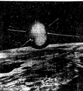
SATELLITE IN SKY.—With Russian announcement that it has launched first earth satellite, this is artist's conception, superimposed on actual photograph of Southwest United States from 140 miles up, of what the U.S. satellite would look like in flight. Drawing of 20-inch diameter globe was prepared at Naval Research Laboratory in Washington, D.C. Russian satellite is said to be 23 inches in diameter, weigh 185 pounds and orbit 500 miles above the earth.

U. S. Sen. Kuchel, a 20-year veteran of California political warfare, yesterday showed his unqualified support behind U. S. Sen. Knowland in his re-nomination to the Senate.