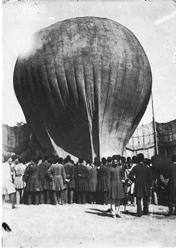
2.5 In 1877 Tehran residents gather to watch the landing of a balloon for the first time in Iran. [Wikipedia]

Bell Helicopter, a division of Textron, Inc., built a factory in Isfahan to produce Model-214 helicopters and Northrop partnered with Iran Aircraft Industries, Inc., to maintain many of the US military aircraft that Iran purchased. The Iranian company was expected to go on to produce aircraft components and eventually complete planes. 18