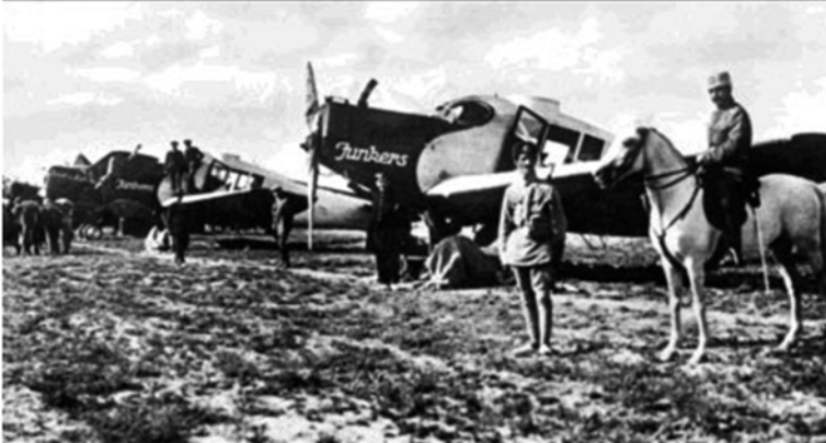
2.8 Iran's Junkers-F13 aircraft.