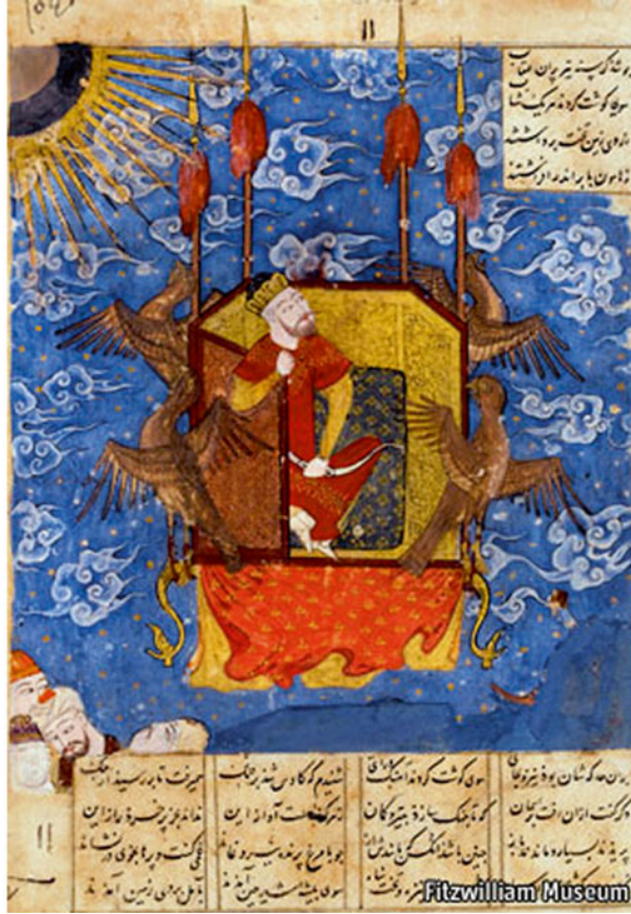
2.1 A page from Shah-Nameh (Book of Kings), in which Ferdowsi describes how Kay Kāvus ascends to Heaven with the aid of hungry eagles.

There are frequent references in Iranian mythology to flying, the most popular being the flights of two Iranian mythical kings Kay Kāvus and Jamshid, and the Iranian hero Rostam. 7 For example, Kay Kāvus ascended into the sky with the aid of hungry eagles. This was described by the highly revered Persian poet Hakim Abul Ghasim Ferdowsi-e Tusi (940-1020) 8 in his magnificent masterpiece Shah-Nameh (Book of Kings) which is the national epic of Iran and the Persian-speaking world. 9