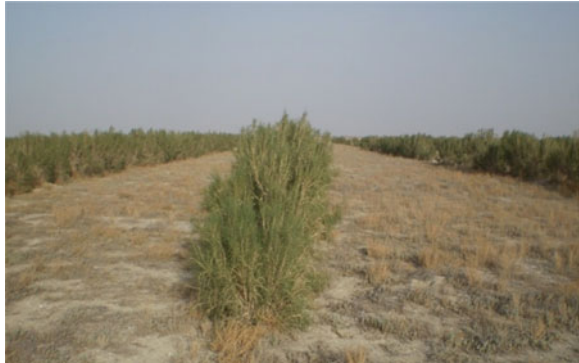
Fig. 6 Forest bands of black saksaul in the Kozjetpes valley

In the Aral Sea area, significant attention is paid to the phyto-reclamation development of the formed land, and in particular soil conservation planting of trees and shrub species (halophytes) which will support the removal of salt, dust and sand, and stop the movement of sand dunes (Figs. 6, 7).