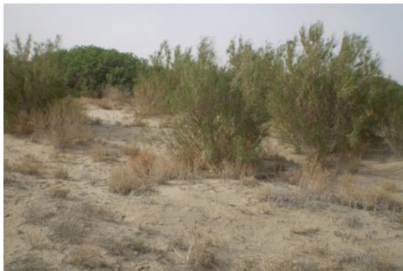
Fig. 7 Natural tamarisk plants on sand in the Aral area

To solve these problems, it is necessary to develop specific programmes for studying contaminated and disturbed lands, develop laws and make appropriate recommendations for re-cultivation and land restoration. The adopted measures will serve as the basis for sustainable and intensive development of agri-industrial complexes in the Republic and ensuring food security of the country, aimed at implementing a common development policy in the agricultural sector.