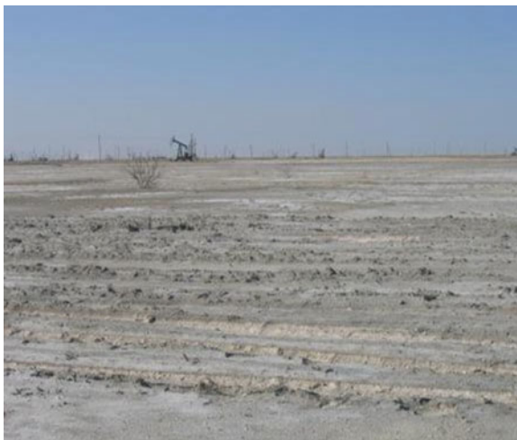
Fig. 2 Bituminous crusts

mobile forms of lead 1–6 times higher than the maximum allowable concentration (MAC), 7–12 times higher for molybdenum and 2–3 times higher for cobalt.