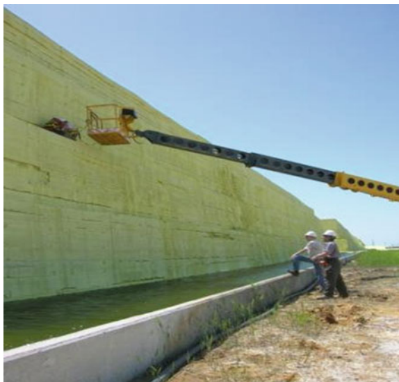
Fig. 5 Sulphur storage

Erosion processes are also developing intensively in the Akmola, South Kazakhstan and Almaty regions. In 8 districts of the Akmola region, there are slightly eroded soils (where the thickness of the humus horizon has decreased by 30 %), medium-eroded soils (by 50 %), and heavily eroded soils (characterized by the lack of an arable horizon).