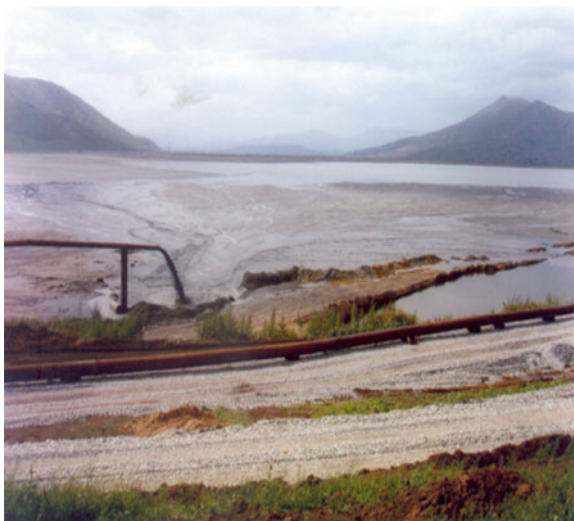
Fig. 4 Contamination with sulphur