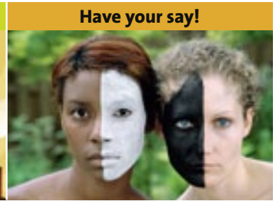
Have your say!