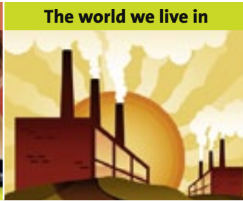
The world we live in