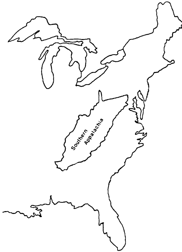
Map 1. Where is the Mountain South?

nonslaveholding majority and a large surplus of poor white landless laborers. In geographic and geological terms, the Mountain South (also known as Southern Appalachia) makes up that part of the U.S. Southeast that rose from the floor of the ocean to form the Appalachian Mountain chain 10,000 years ago (see Map 1). In a previous book, I documented the historical integration of this region into the capitalist world system. The incorporation of Southern Appalachia entailed nearly one hundred fifty years of ecological, politico-economic, and cultural change. Beginning in the early 1700s, Southern Appalachia was incorporated as a peripheral fringe of the European colonies located along the southeastern coasts of North America. During the early eighteenth century, the peripheries of the world economy included eastern and southern Europe, Hispanic America, and “the extended Caribbean,” which stretched from