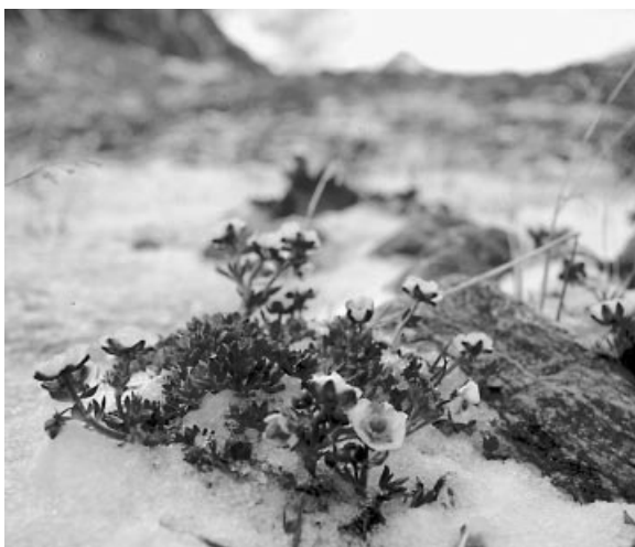
Fig. 1.1. Fit to survive and reproduce under demanding environmental conditions ( Ranunculus glacialis , Alps 2600 m)

may stimulate (in the short term) growth and reproduction, but in the long term, may eliminate an organism from its previously more “limiting” habitat by competitive replacement. Environments are only limiting to those which are not fit.