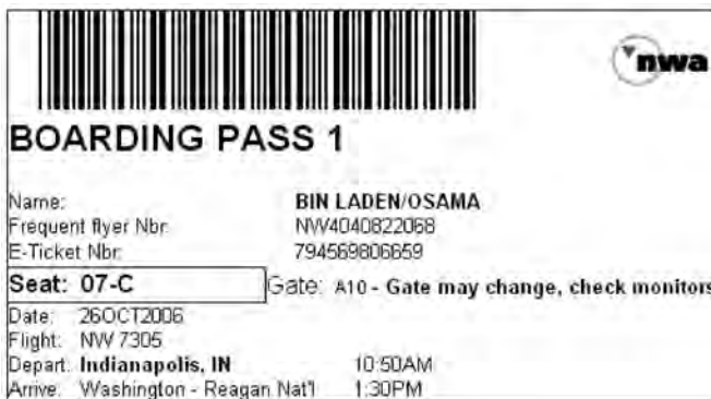
Fig. 1. A fake boarding pass created by a now shut-down website.

The simplest method of producing a fake boarding pass is to use the html web page that the airline returns upon completion of online check-in. By saving this document locally, a user has everything she needs to produce documents good enough to get past current TSA checkpoints. Multiple websites have been created that automate this process, and allow anyone to print out a completely customizable yet authentic looking boarding pass. One of the sites was publicly shut down by the FBI (see figure 1) [23], while another remains online [1].