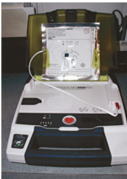
FIGURE 2-3. Automatic external defibrillators have been made increasingly more portable and user friendly. Adhesive electrodes are placed over the patient's cardiac apex and upper right chest to detect the cardiac rhythm. With audible and visual prompting, the device advises the operator to deliver a defibrillating shock by pressing a button.