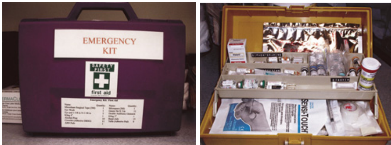
FIGURE 2-2. An office crash cart should be readily accessible, with clearly labeled and updated contents.