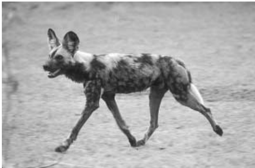
Figure 1.1 African wild dogs are unusual canids, with a variegated coat, long legs, and large rounded ears.

just behind the forelegs, and dogs with little or no white elsewhere may have white on their forelegs or on the ventral surface of their neck or chest. The tail is almost always tricolored, with brown at the root, a black band, and a white tip. Some dogs have two black tail-bands, or black dots, or a black tip below the white, and a few have no white at all. Coat patterns are not bilaterally symmetrical. The asymmetry is great enough that photographs of a