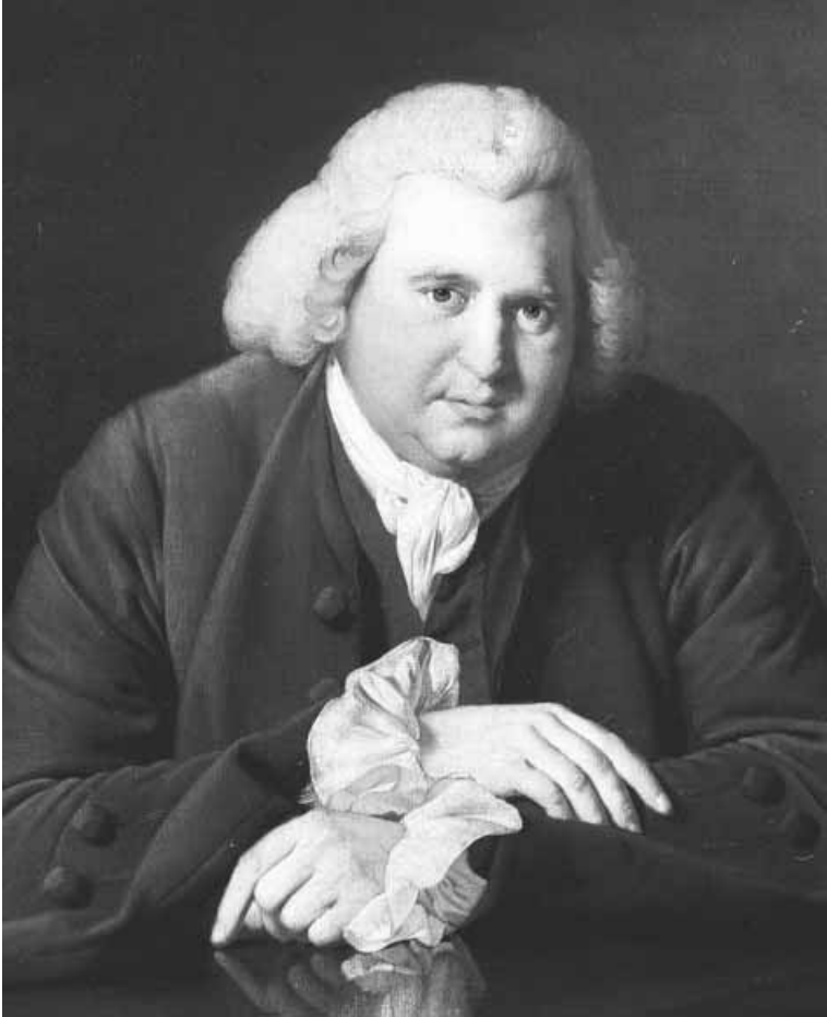
Erasmus Darwin at the age of 38, painted by his friend and patient Joseph Wright of Derby in 1770.

Cambridge University Press 0521815266 - The Life of Erasmus Darwin Charles Darwin Frontmatter More information