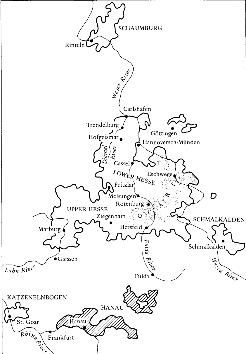
Hesse-Cassel under Frederick II.