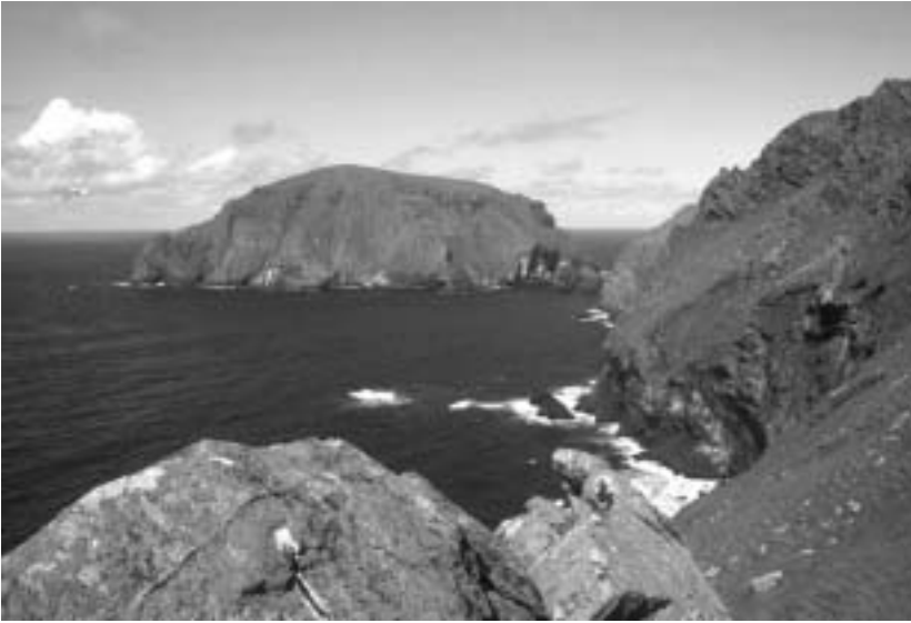
FIG. 1.4. Soay from Hirta.

late winter (Grubb 1974c). The occurrence of intermittent population crashes in the sheep makes it possible to investigate the causes and consequences of episodes of acute starvation. As Malthus (1798) and Darwin (1859) originally realised, starvation is one of the principal driving forces both of population regulation and of natural selection. As it is feasible to catch and mark large numbers of individual sheep on St Kilda and to monitor their growth, condition and breeding success throughout their lifespans, we can compare the effects of starvation on different categories of animals, allowing us to examine the interactions between population dynamics and selection. As a result, the Soay sheep population allows us to ask three questions of fundamental importance in understanding the dynamics and evolution of animal populations. First, what are the causes of fluctuations in population density and to what extent do different demographic processes contribute to changes in population size? Second, how do changes in population density affect the intensity and direction of natural and sexual selection? And, third, how does population density affect the costs and benefits of reproduction and the reproductive strategies that would be expected to evolve?