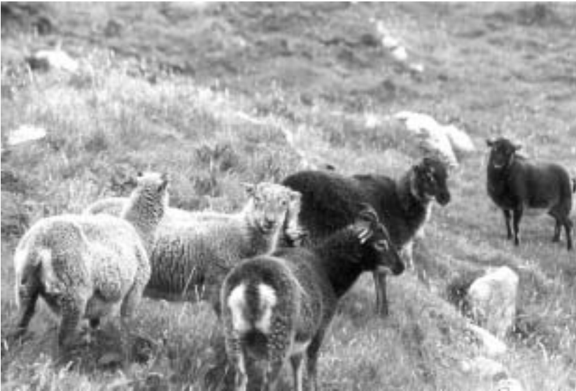
FIG. 1.3. (a) Soay sheep grazing among cleits in the fields behind the street, Village Bay; Calum Mór's house in the foreground. (b) A typical party of light wild and dark wild ewes with a range of horn types (left to right: scurred, polled, normal-horned, scurred).