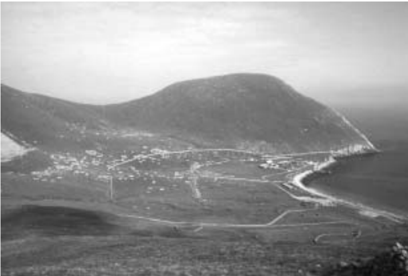
FIG. 1.2. (a) Dun, Hirta and Soay from Boreray, with Stac Lee in the foreground. (Photograph by Ian Stevenson.) (b) Village Bay from the south-west showing the Head Dyke enclosing the village street, the meadows between the street and the sea, and the fields behind the street; Oiseval in the background. (Photograph by Ian Stevenson.)