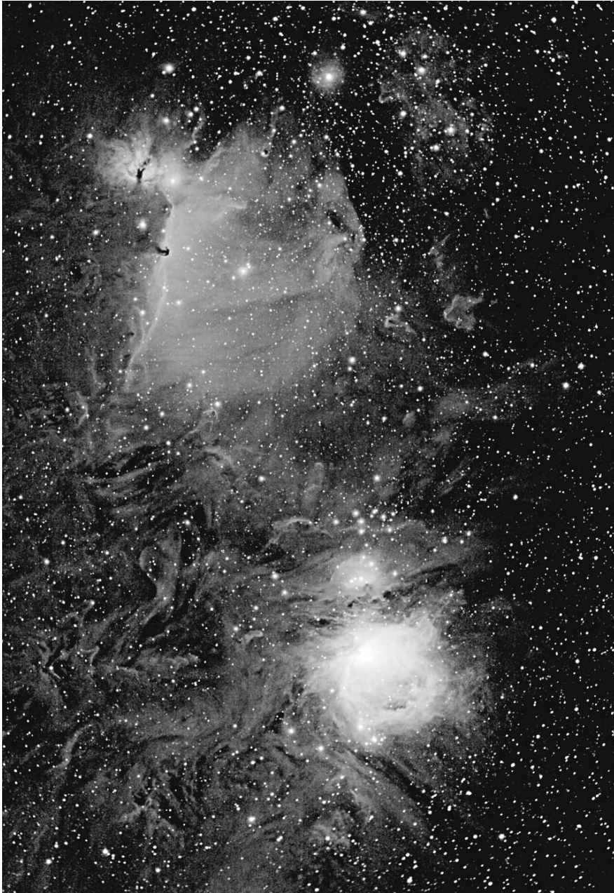
Fig. 1.1. Turbulent ionized plasmas filling a nearby region of space around the active star-forming region of the Orion Nebula.