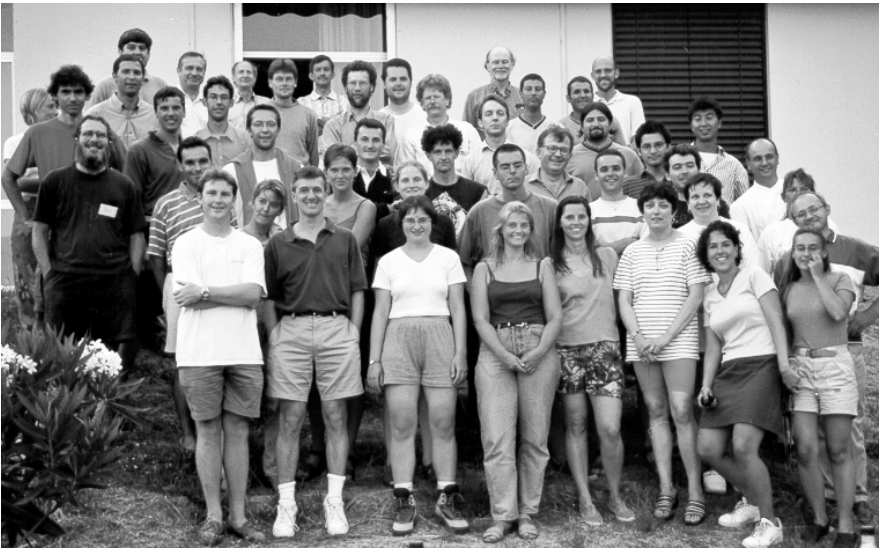
Some of the participants of the Cargèse School