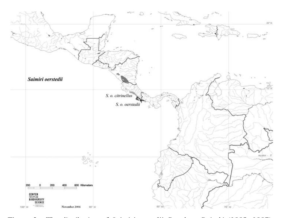
Figure 2. The distribution of Saimiri verstedii . Based on Boinski (1985, 1987), Boinski et al. (1998), Reid (1997), Sierra et al. (2003), Matamoros and Seal (2001), Rodríguez-Luna et al. (1996), and Wong (1990). Map drawn by Mark Denil and Kimberly Meek (Center for Applied Biodiversity Science, Conservation International, Washington, DC).

The two subspecies listed here are recognized by Hill (1960) and Hershkovitz (1984). Cabrera (1958) and Thorington (1985), on the other hand, regarded the Central American squirrel monkey to be a subspecies of