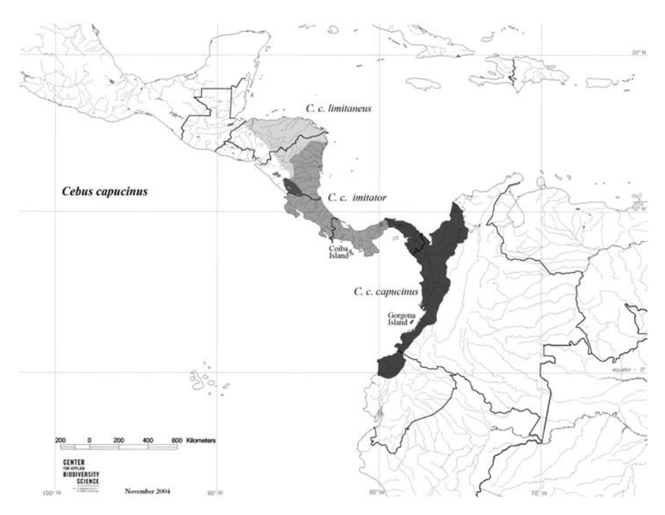
Figure 3. The distribution of Cebus capucinus . Based on Defler (2003), Eisenberg (1989), Hill (1960), Hall (1981), Hernández-Camacho and Cooper (1976), Marineros and Gallegos (1998), Matamoros and Seal (2001), Reid (1997), and Rodríguez-Luna et al. (1996). The numbers indicate two localities where capuchin monkeys have been reported but their presence has yet to be confirmed; 1: Mayan Mountains of western Belize (the Chiquebul forest and in the region of the Trio and Bladen branches of the Monkey River); 2: Sierra del Espíritu Santo near the Guatemala–Honduras border (see text). Map drawn by Mark Denil and Kimberly Meek (Center for Applied Biodiversity Science, Conservation International, Washington, DC).

C. capucinus for Colombia: C. c. capucinus and C. c. curtus. Groves (1993, 2001), having reviewed specimens in the US National Museum, the American Museum of Natural History, and the Museum of Comparative Zoology at Harvard University, also regarded all the subspecies listed by Hershkovitz (1949) and Hill (1960) to be junior synonyms of a monotypic C. capucinus. Here, we list the three Mesoamerican forms separately to draw attention to each one, but this should not be taken to imply that we endorse their status as separate subspecies. There are no records of this species in El Salvador or Mexico. There are unconfirmed reports of its occurrence in southern Belize and eastern Guatemala.