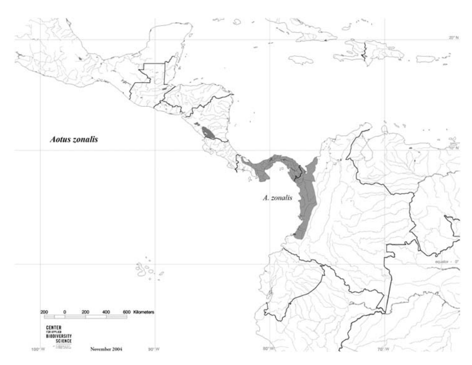
Figure 4. The distribution of Aotus zonalis . Based on Defler (2003), Hall (1981), Hernández-Camacho and Cooper (1976), Hershkovitz (1983), Matamoros and Seal (2001), Reid (1997), Rodríguez-Luna et al. (1996), and Timm (1988). The numbers indicate two unconfirmed localities in Costa Rica: 1: La Selva Biological Reserve, a field station of the OTS, 1 km south of Puerto Viejo de Sarapiquí, Heredia (10°26′N, 83°59′W, altitude 35–150 m) (three sightings; Timm, 1988); 2: Near Bribri, Limón Province, about 70 km north northwest of Isla Bastimentos, Panama, the northernmost documented population of night monkeys (reported; Vaughan, 1983). Map drawn by Mark Denil and Kimberly Meek (Center for Applied Biodiversity Science, Conservation International, Washington, DC).

A. t. lemurinus (I. Geoffroy, 1843) and A. t. griseimembra Elliot, 1912a. He proposed that griseimembra in the northern lowlands and far northwestern Colombia (Type locality: Hacienda Cincinnati, northeast of Santa Marta, northwestern slope of the Sierra Nevada de Santa Marta, Magdalena, Colombia, altitude 1480 m) was the form extending into Panama, and included zonalis Goldman, 1914 as a synonym. Hill (1960) provided a very similar appraisal, one perhaps significant difference being that he placed the form bipunctatus Bole, 1937 from the Azuero Peninsula as a synonym of griseimembra, whereas Hershkovitz (1949, p. 404) had stated that "The night monkey of the Azuero