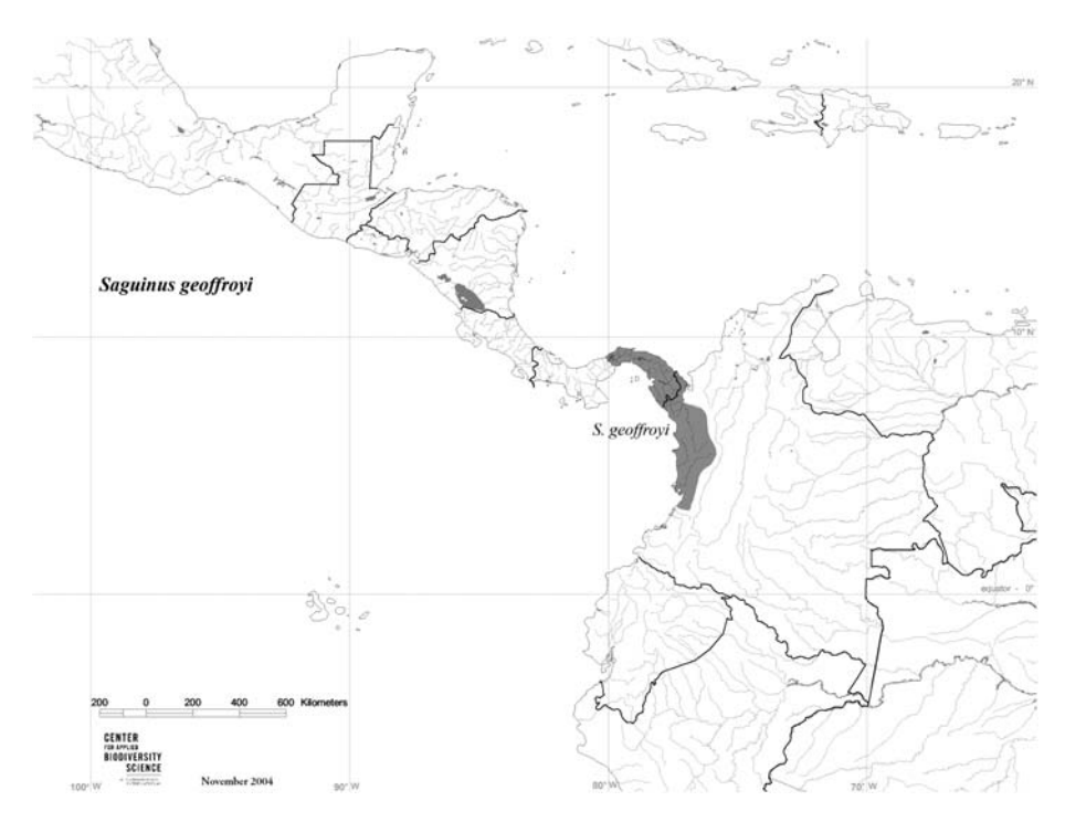
Figure 1. The distribution of Saguinus geoffroyi . Based on Eisenberg (1989), Emmons and Feer (1997), Hernández-Camacho and Cooper (1976), Hershkovitz (1977), Matamoros and Seal (2001), Mast et al. (1993), Reid (1997), Rodríguez-Luna et al. (1996), Rylands et al. (1993), and Skinner (1985). Map drawn by Mark Denil and Kimberly Meek (Center for Applied Biodiversity Science, Conservation International, Washington, DC.

underparts. It was, however, not listed in Elliot's (1913) "A Review of the Primates", and Elliot (1914) reported that the investigation of further material from Colombia had indicated that the yellowish underparts were due to staining (Hershkovitz [1977] argued that it is in fact natural) and that the skull size, although large, was within the natural variation of that found for O. geoffroyi. Hernández-Camacho and Cooper (1976, p. 41) recorded that "of the few museum specimens of S. geoffroyi known for Colombia as well as those seen in captivity (largely from the region of Acandí), a large percentage have distinct sulfurous yellowish underparts, including lightly pigmented areas of the limbs." Hershkovitz (1977) found that S. geoffroyi does in fact get paler from south to north. The most saturate series he examined was from Sandó (locality 28) in the Chocó. Anthony (1916) remarked on the yellowish underparts of animals he